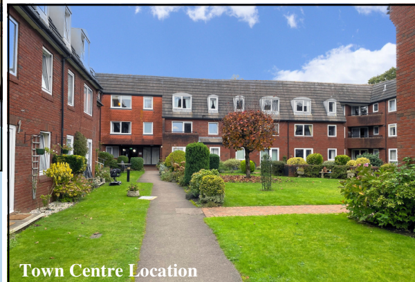
Town Centre Location

IMPORTANT NOTE: These particulars are believed to be correct but their accuracy is not guaranteed. They do not form part of any contract. Nothing in these particulars shall be deemed to be a statement that the property is in good structural condition or otherwise, nor that any of the services, appliances, equipment or facilities are in good working order or have been tested. Purchasers should satisfy themselves on such matters prior to purchase. Ref W04983