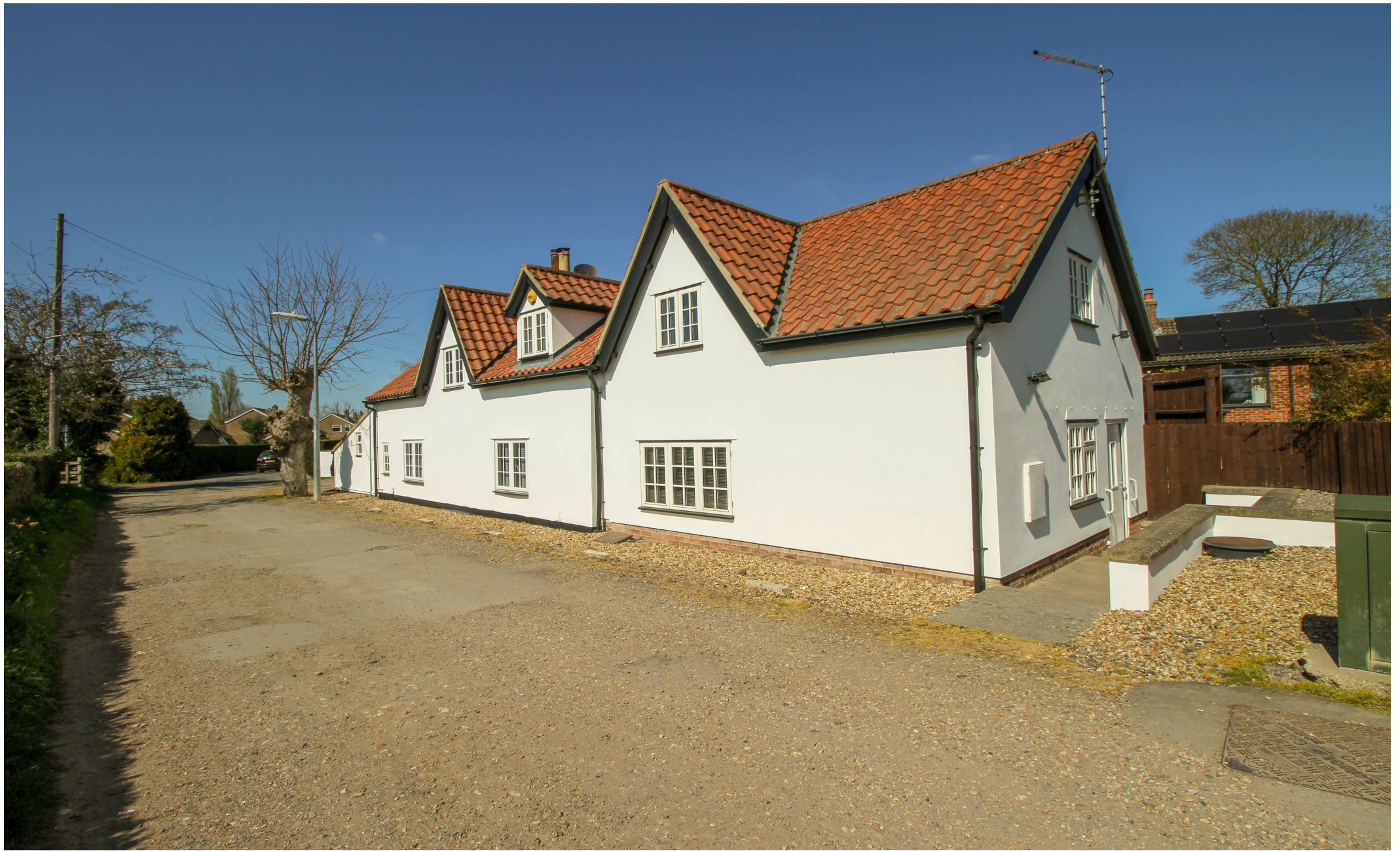
Spring Close Burwell Cambridgeshire