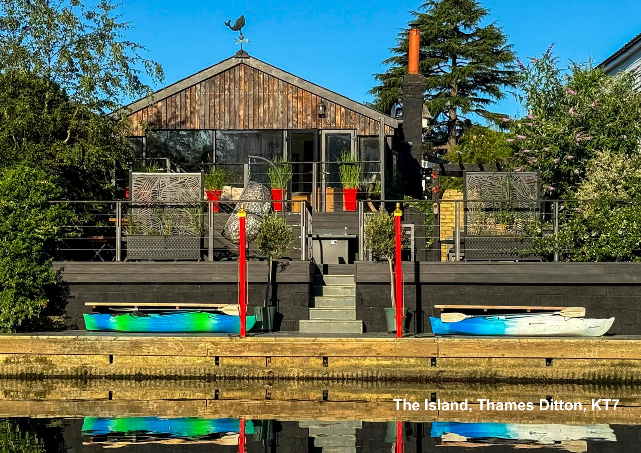
The Island, Thames Ditton, KT7