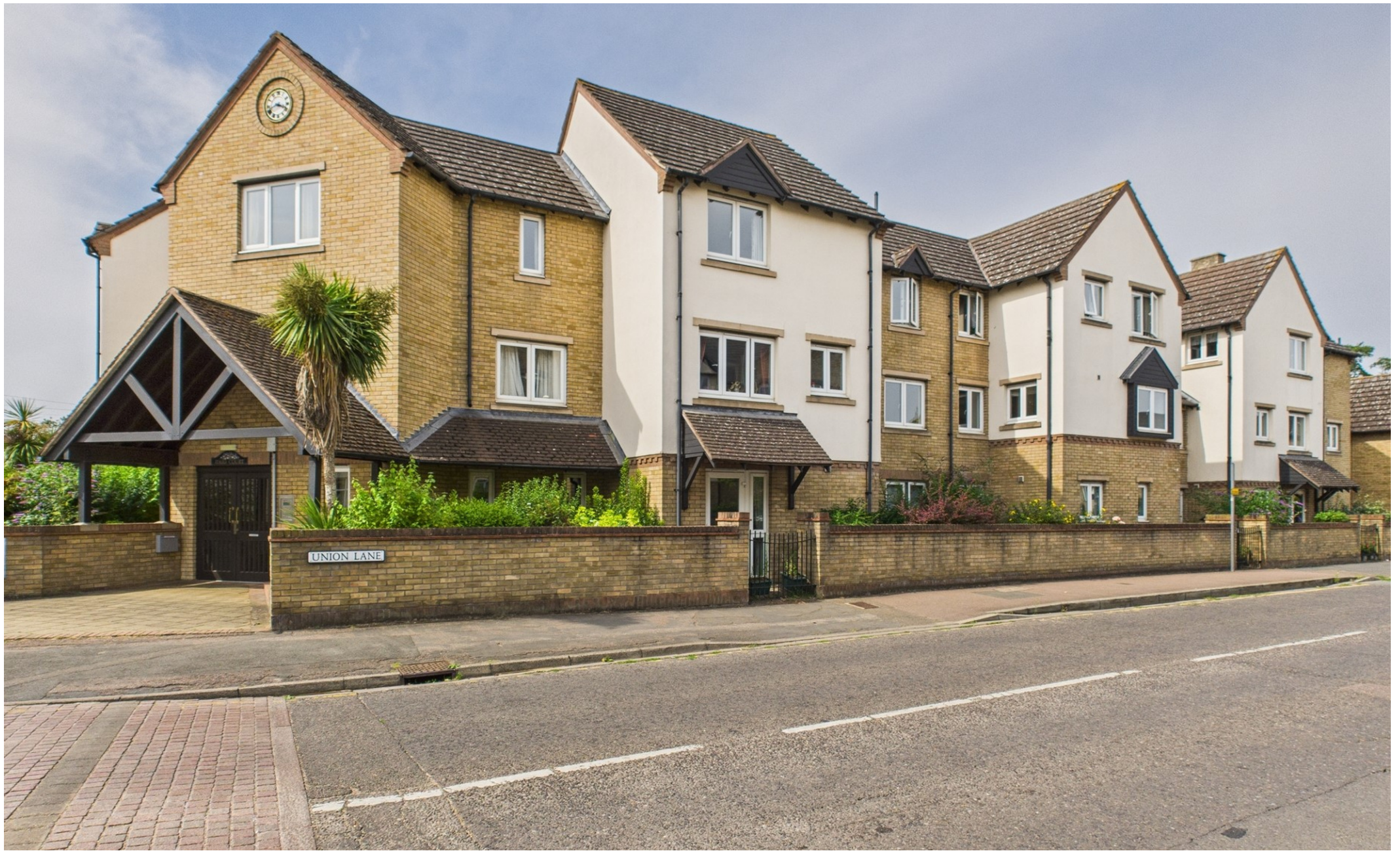
Haig Court, Cambridge CB4 1TT