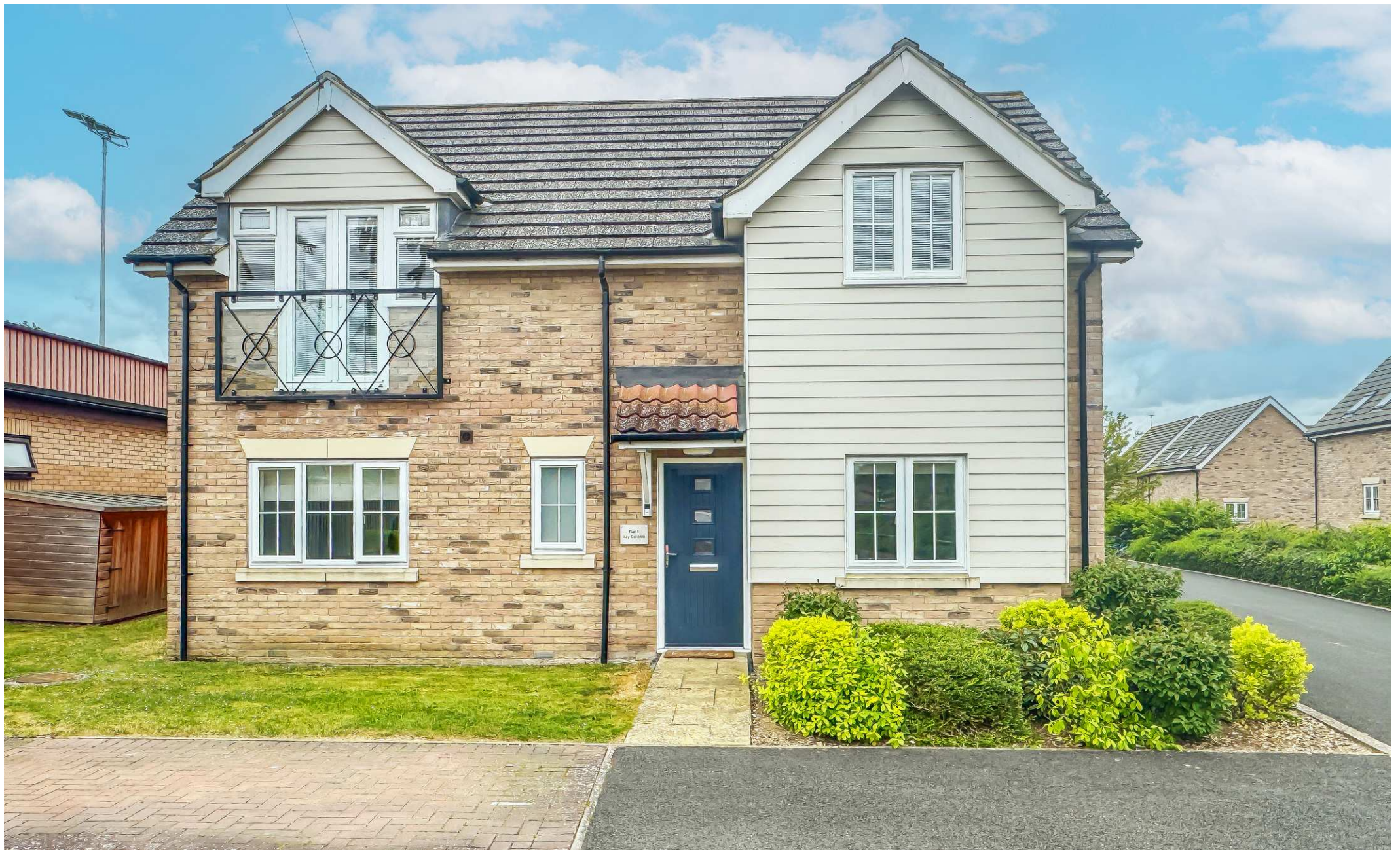
May Gardens, Newmarket, Suffolk