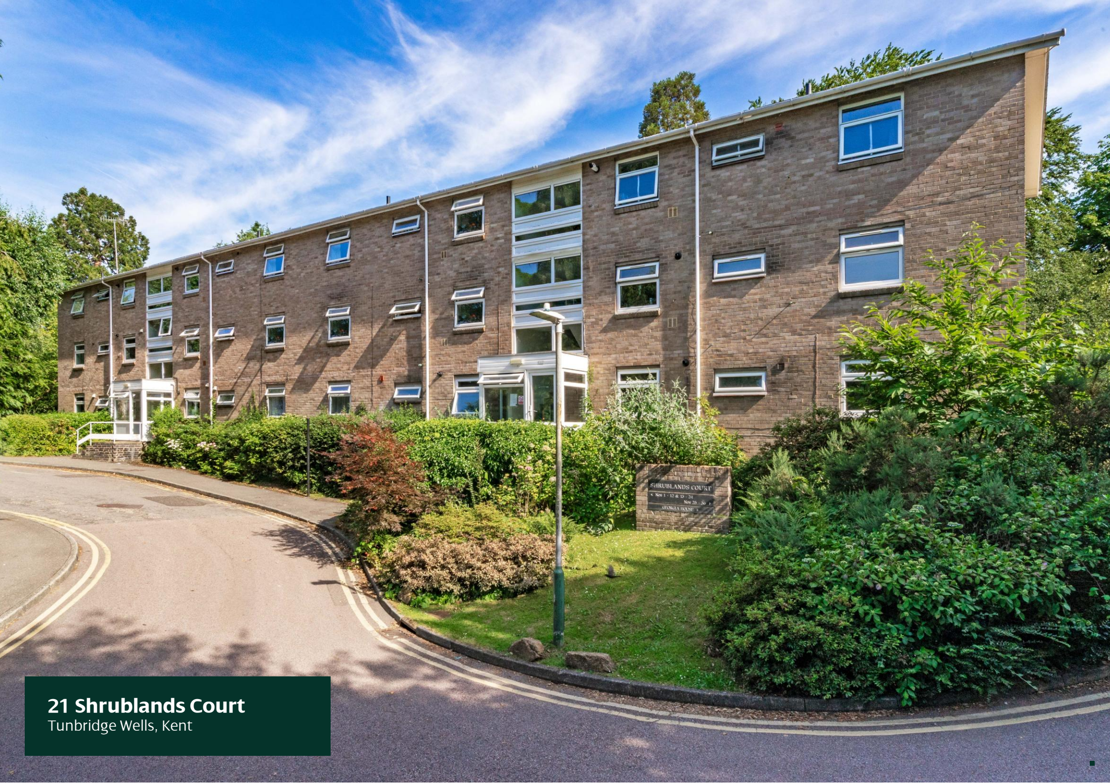
21 Shrublands Court Tunbridge Wells, Kent