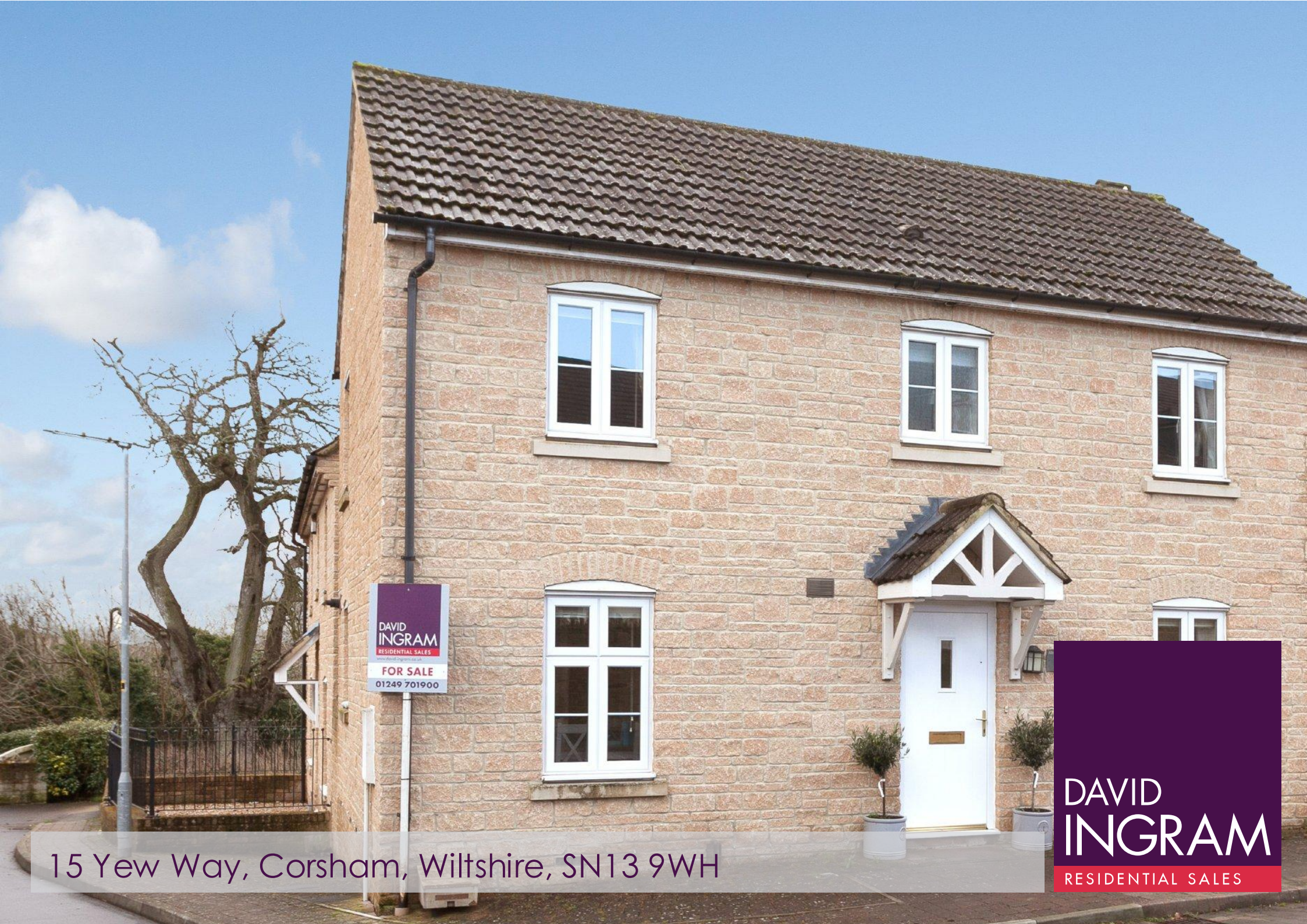
15 Yew Way, Corsham, Wiltshire, SN13 9WH