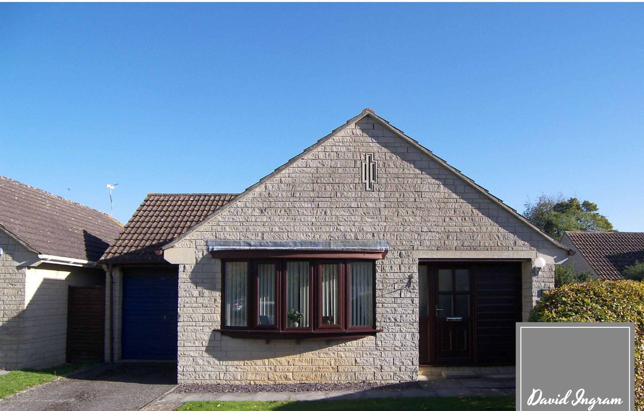
19 Light Close, Corsham, Wiltshire, SN13 0DF