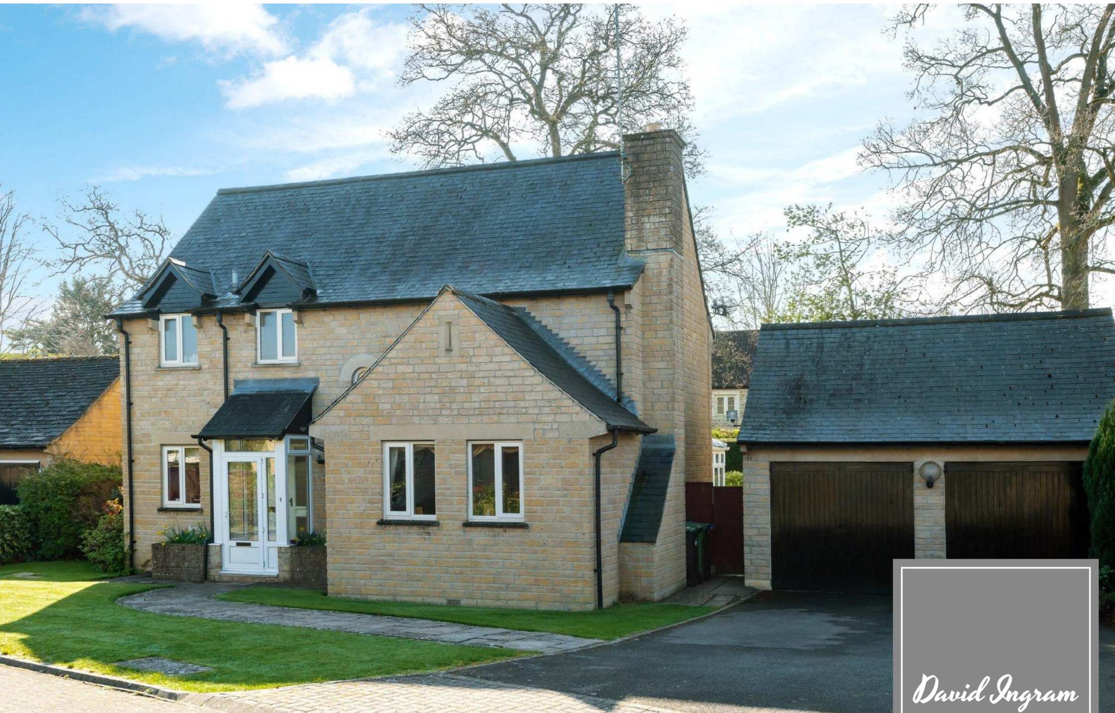
3 Woodlands, Pickwick, Corsham, Wiltshire, SN13 0DA