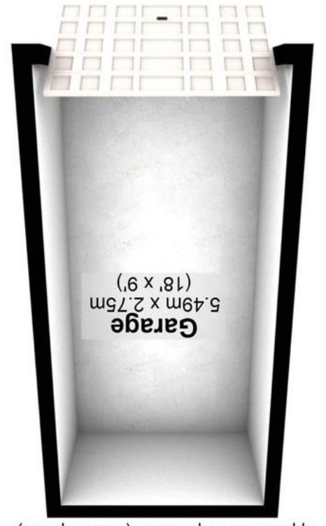
Garage Approx. 15.1 sq. metres (162.3 sq. feet)