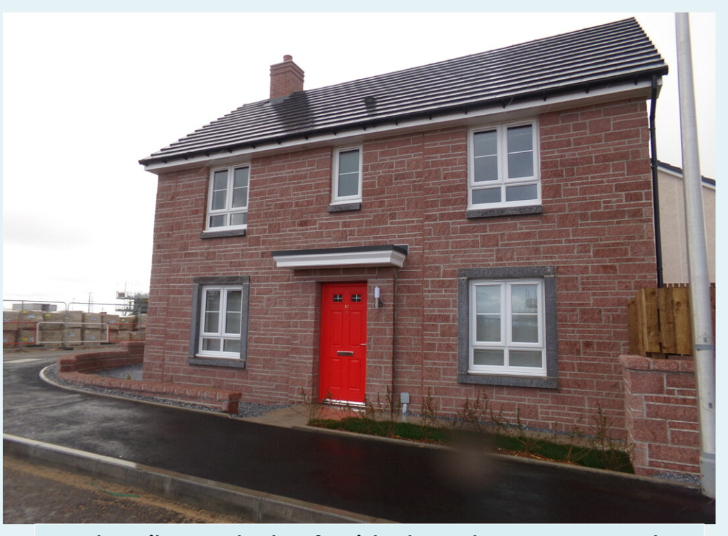
Newly Built Detached Unfurnished 3 Bedroom House on the Findrassie Estate STRICTLY NO PETS & NO SMOKERS

Hallway with Cloakroom WC, Lounge, Kitchen with doors out on the Garden & Utility Room with built-in storage cupboard & Rear Entrance Door which leads out to the side of the property Integrated fridge freezer, hob, oven, overhead extractor hood & dishwasher to the Kitchen