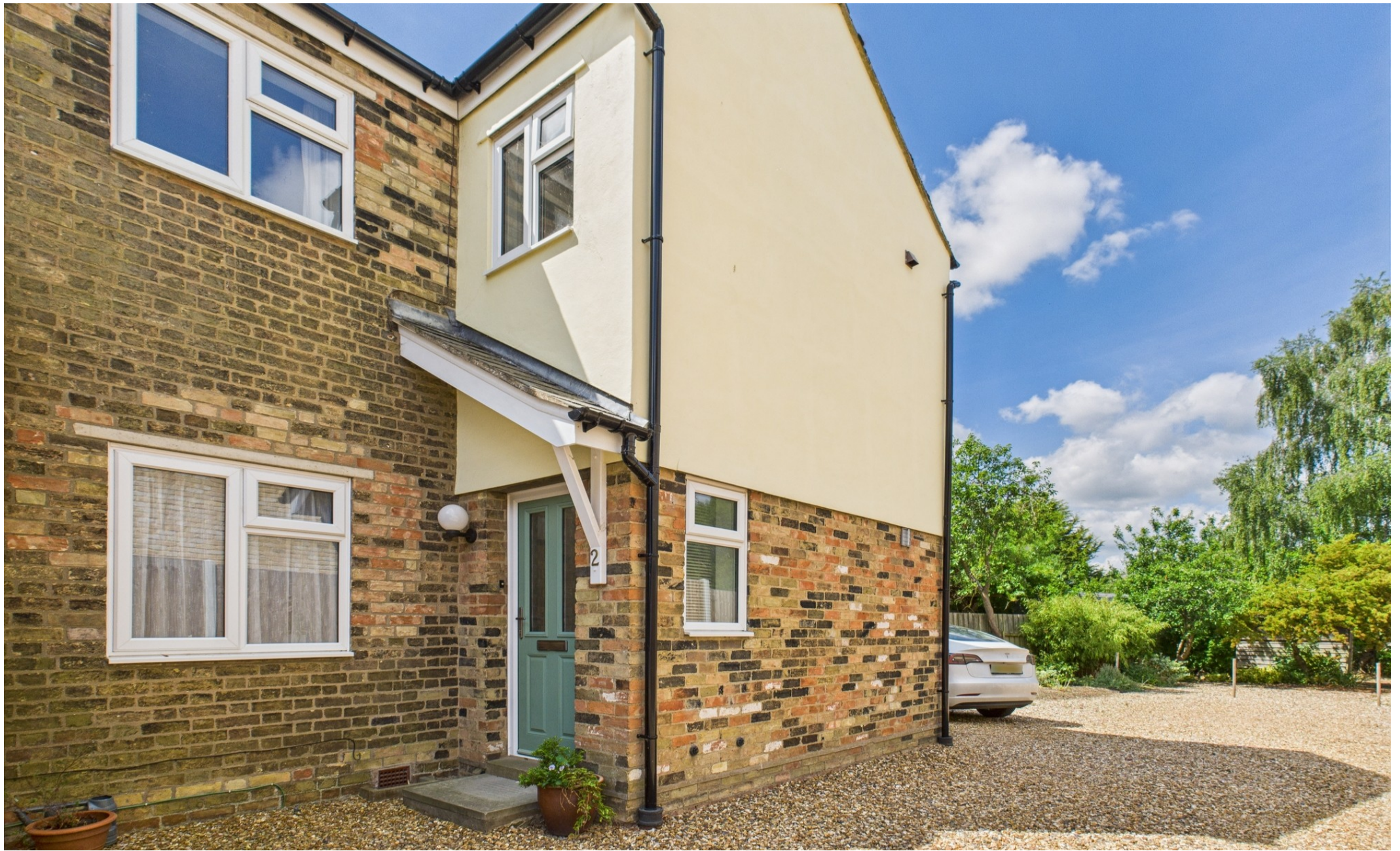
Station Cottage, Station Road, Longstanton CB24 3DS