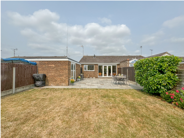
OUTBUILDING (CONVERTED GARAGE) 9' 8" x 7' 8" (2.95m x 2.34m) Double glazed French doors. Wood effect tiled flooring. Plastered ceiling. Power and lighting. Up and over door to front.