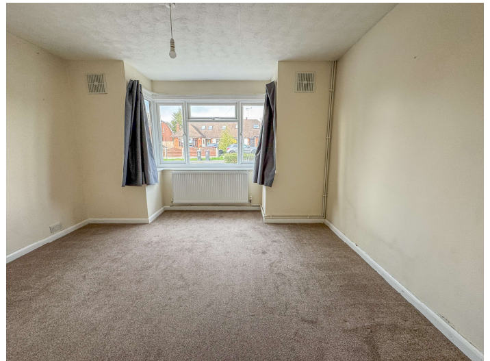
BEDROOM TWO 11' 6" x 10' 2" (3.51m x 3.1m) Double glazed window to front aspect. Radiator.