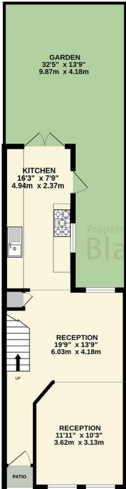
GROUND FLOOR 431 sq.ft. (40.0 sq.m.) approx.

TOTAL FLOOR AREA : 869 sq.ft. (80.7 sq.m.) approx.