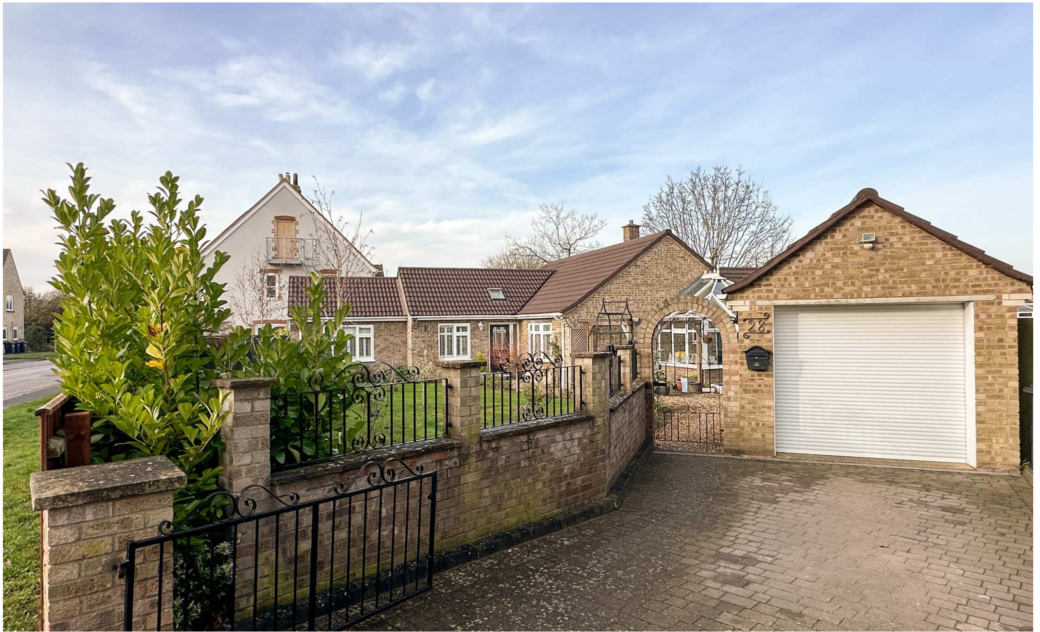
Reach Road Burwell Cambridgeshire