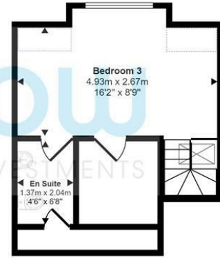
First Floor Approx 26 sq m / 282 sq ft

This floorplan is only for illustrative purposes and is not to scale. Measurements of rooms, doors, windows, and any items are approximate and no responsibility is taken for any error, omission or mis-statement. Icons of items such as bathroom suites are representations only and may not look like the real items. Made with Made Snappy 360.