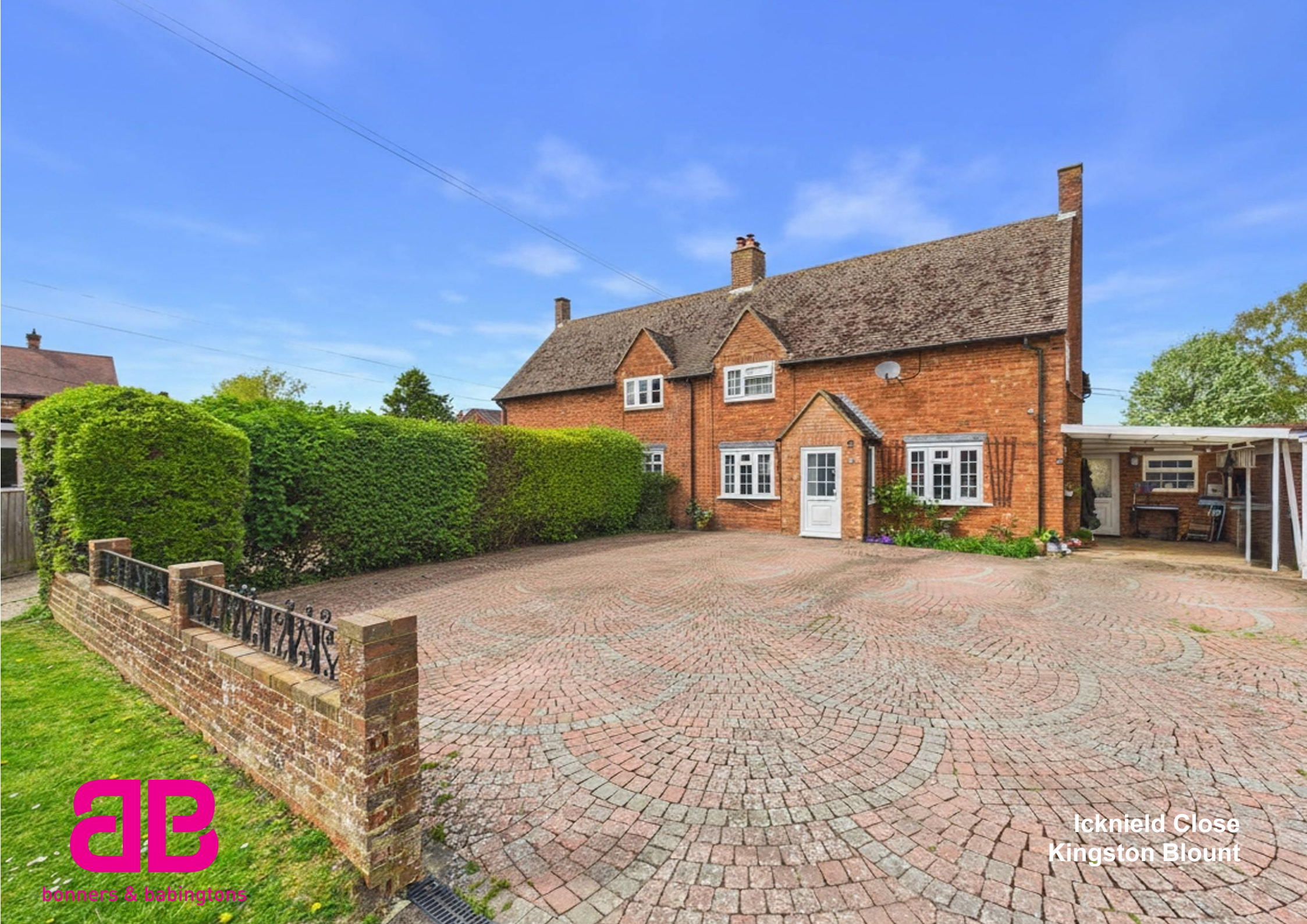
Icknield Close Kingston Blount