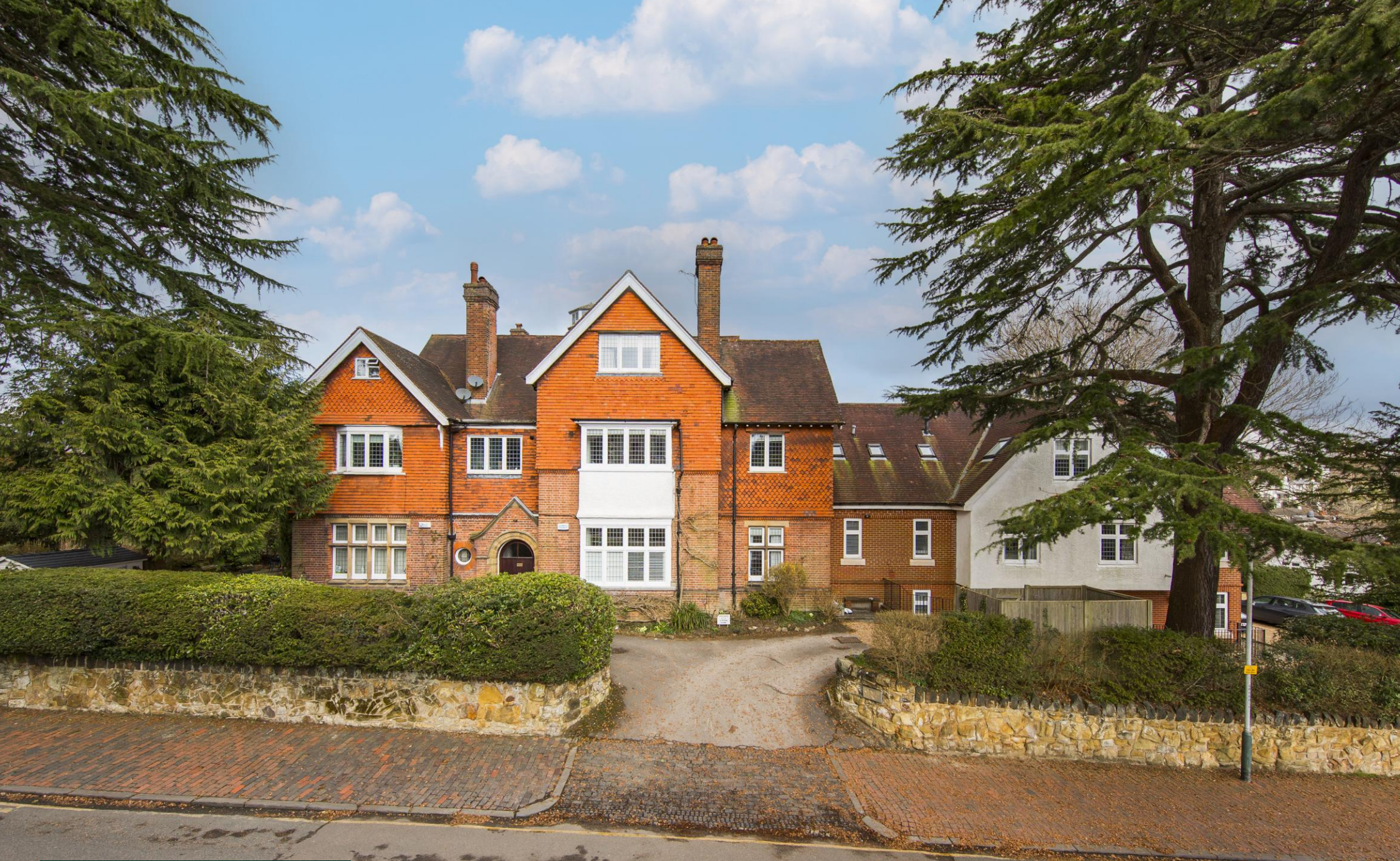
Flat 7, Rodmell Place Tunbridge Wells, Kent