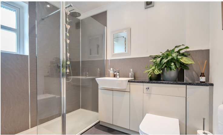
House Shower Room