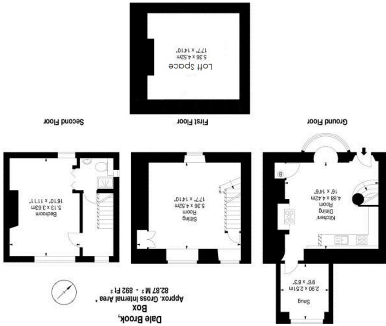
Illustration For Identification Purposes Only. Not To Scale * As Defined by RICS - Code of Measuring Practice

Agents Note: Whilst every care has been taken to prepare these sales particulars, they are for guidance purposes only. All measurements are approximate and for general guidance purposes only and whilst every care has been taken to ensure their accuracy, they should not be relied upon and potential buyers are advised to recheck the measurements.