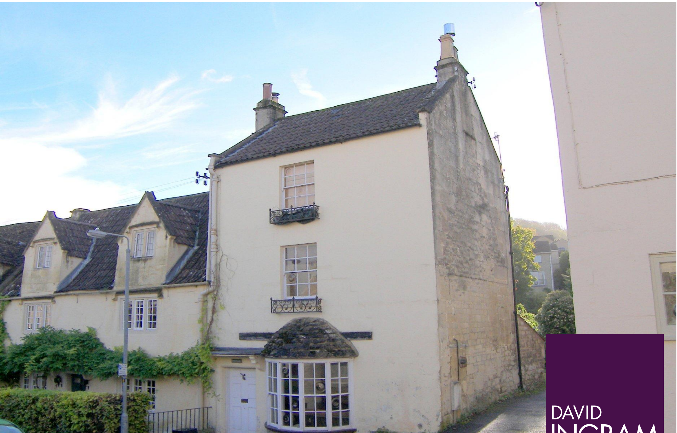
Dalebrook, Market Place, Box, Corsham, Wiltshire, SN13