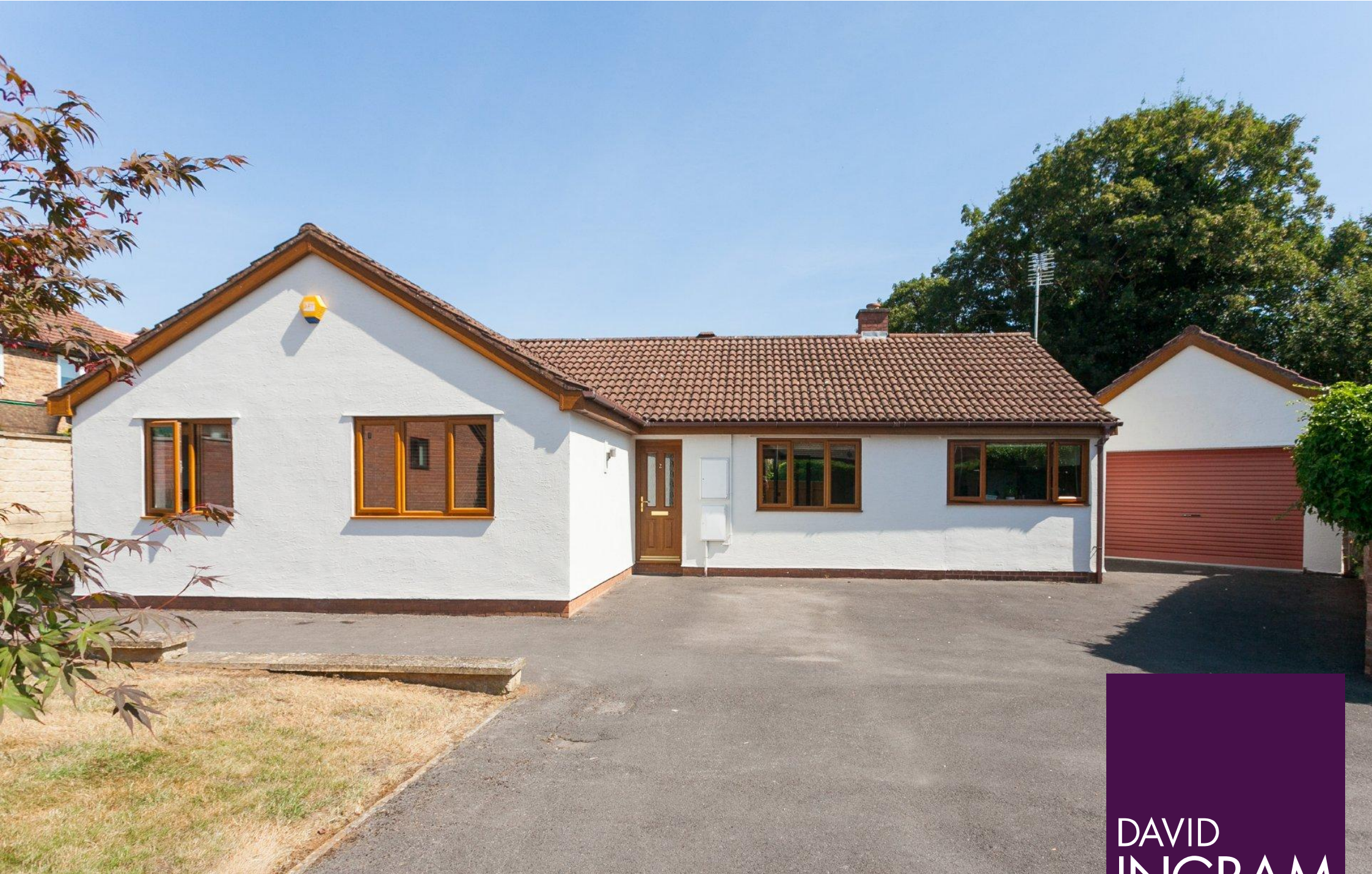
2 Syon Close, Corsham, Wiltshire, SN13 9UZ