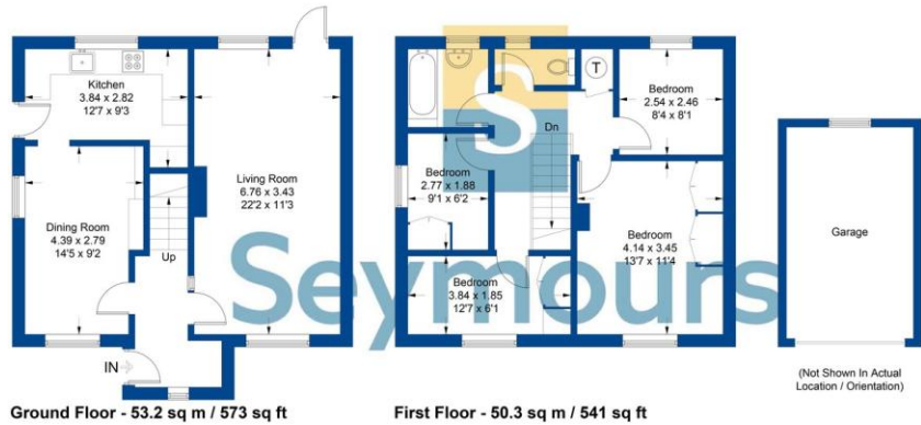
Illustration for identification purposes only, measurements are approximate, not to scale. FloorplansUsketch.com © 2024 (ID1117724)