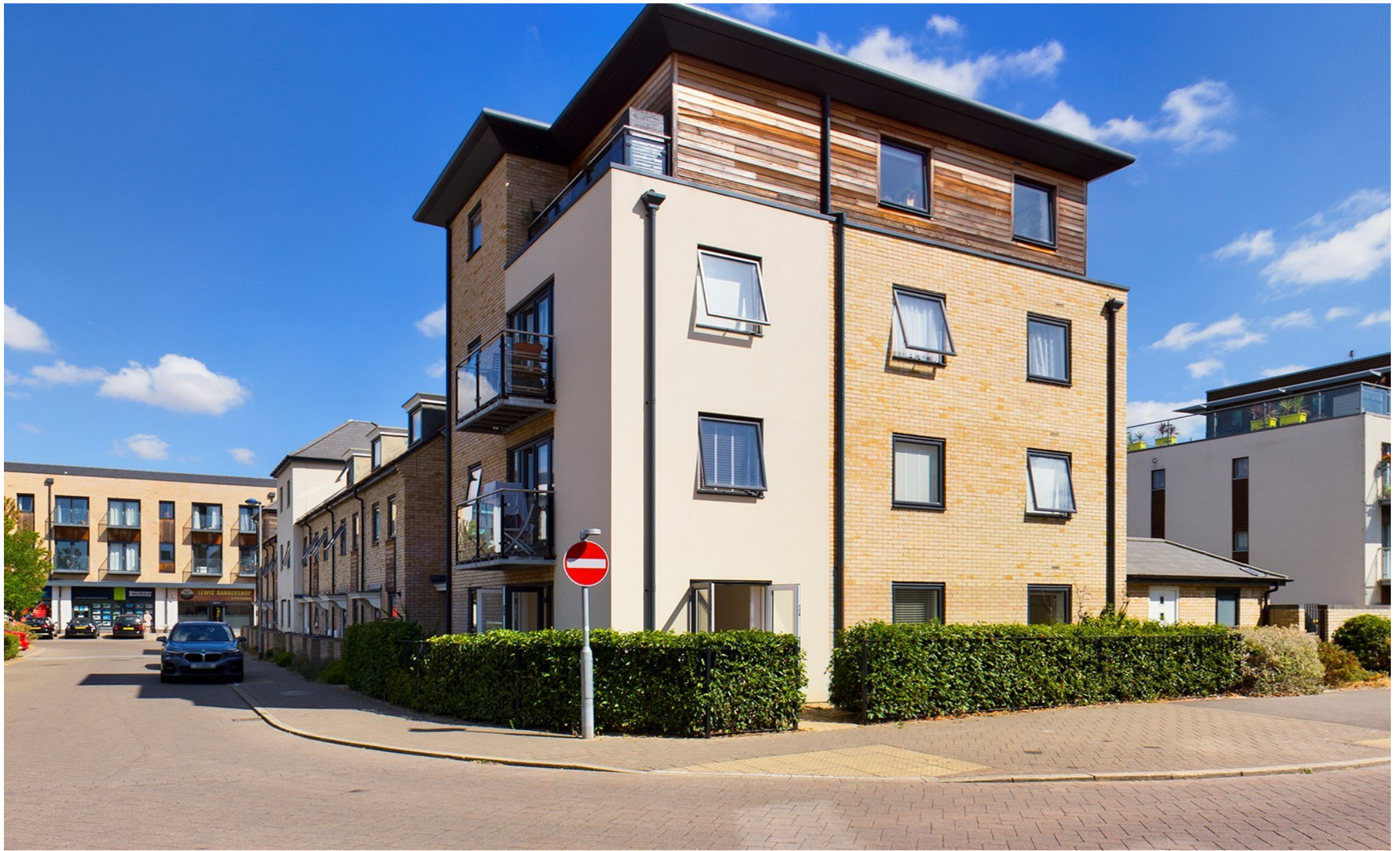
Unwin Square, Cambridge CB4 2ZD