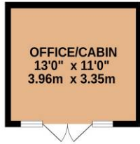
GROUND FLOOR 606 sq.ft. (56.3 sq.m.) approx.