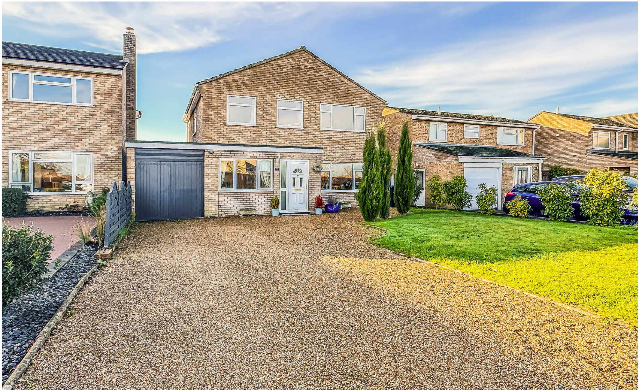
Peterhouse Drive, Newmarket, Suffolk