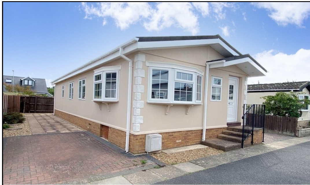
Spacious Park Home with 16' Kitchen/Breakfast Room & Study

26 Pilgrims Park, Poulner, Ringwood. BH24 1TQ