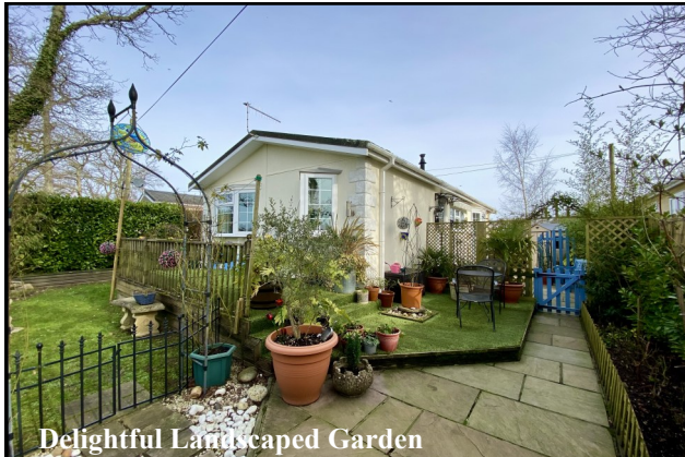
Delightful Landscaped Garden