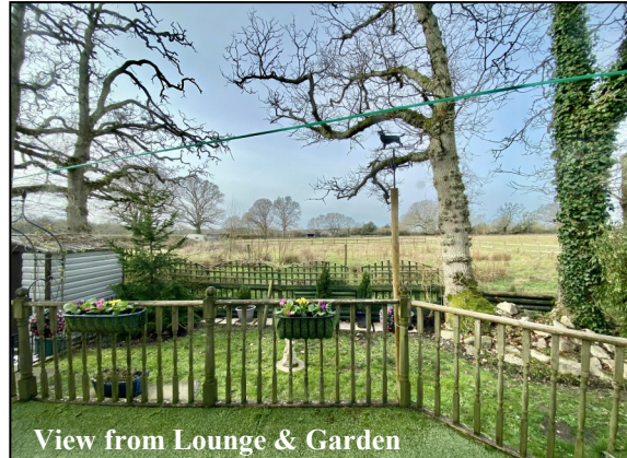
View from Lounge & Garden

Well Presented Tingdene 'Dolbin Lodge' approx 40' x 20' Manufactured circa 2011 Beautifully presented 'Gated' Residential Park with wonderful grounds including large dog walking area, set in a semi-rural location near to Poole & Wareham.