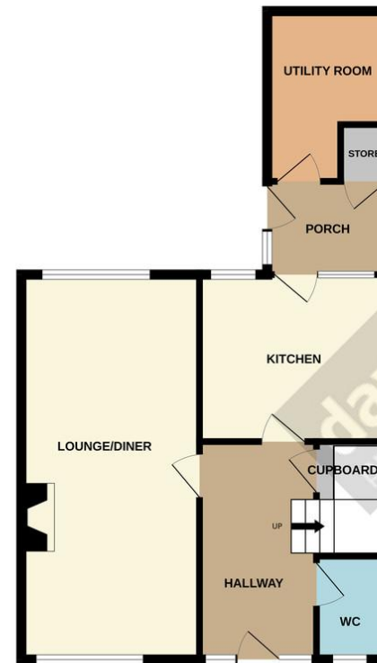
GROUND FLOOR 54.4 sq.m. (585 sq.ft.) approx.