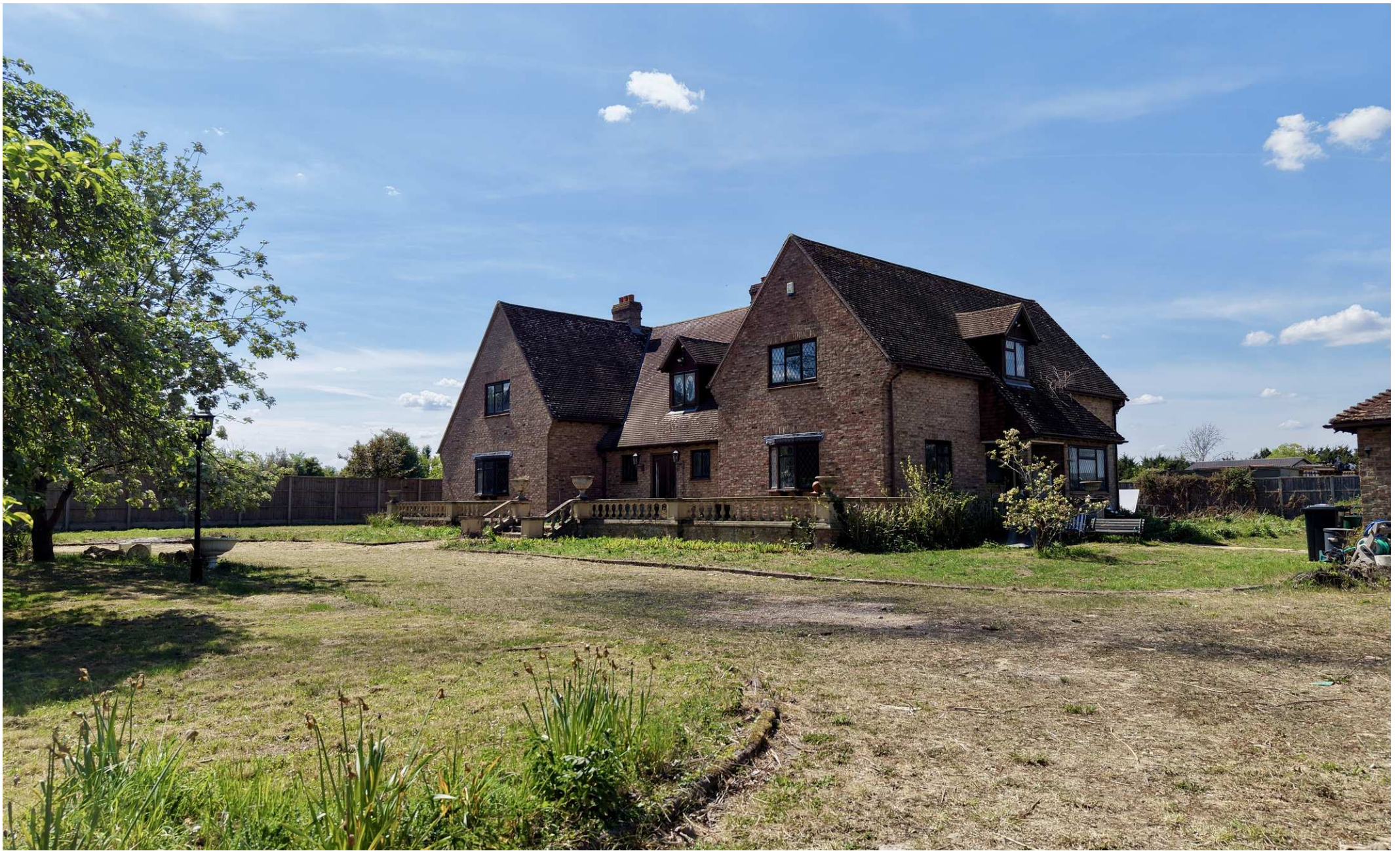
Rosewall Manor, Weirs Drove, Burwell