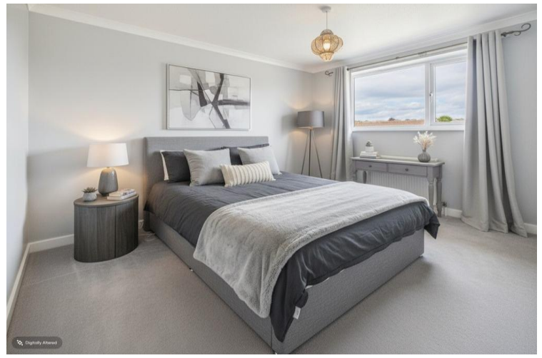
Virtually Staged Bedroom 2