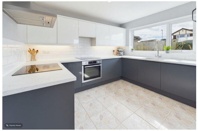
Virtually Staged Kitchen