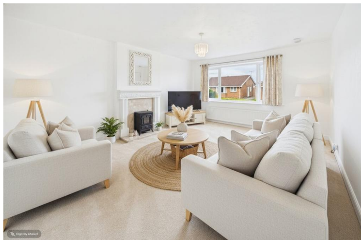
Virtually Staged Lounge