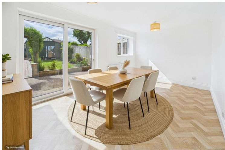
Virtually Staged Dining Room