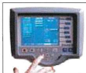
One Touch Operation

System pictured with optional workstation.