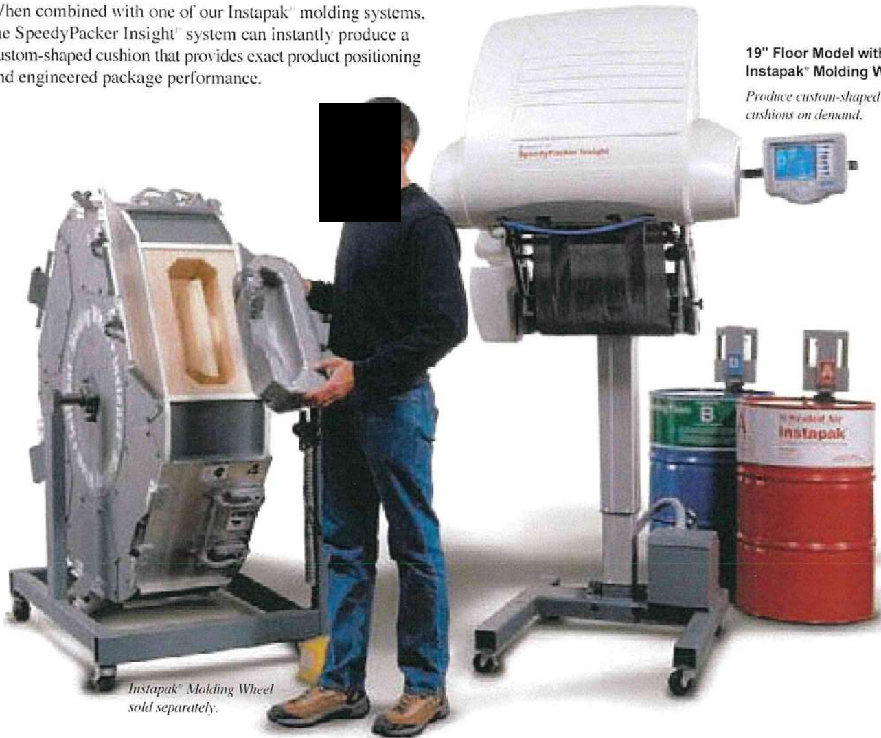
Instapak® Molding Wheel sold separately.

Produce custom-shaped molded cushions on demand.