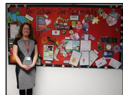
A picture of our school community

Children use Geographical enquiry to ask and respond to simple closed questions through teacher led enquiries, e.g. how many classrooms are there in our school? Which room is the biggest? Use first-hand observation skills to enhance their locational awareness and investigate their surroundings, e.g. of their journey to school, routes and places within school. Use information books, pictures, picture maps and globes as sources of information. Develop direction and location skills by following directions (up, down, left/right, forwards/backwards) Use a simple picture map to move around school and recognise that it is about a place. Draw around objects to make a plan. Find answers to simple questions about the past e.g. How has our school changed in recent years (new building) from sources of information? E.g. artefacts, photographs, observation and first-hand recount/interview.