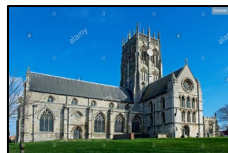
St Augustine's church