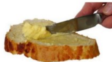
Spreading butter on bread