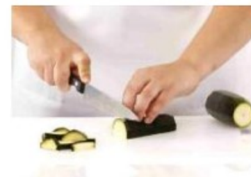
Cutting using the claw technique