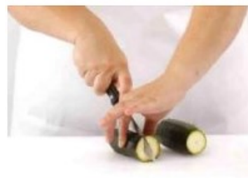
Cutting using the bridge technique