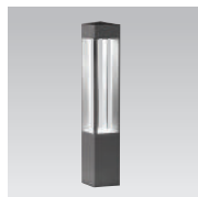
Weight: 22.71 lb