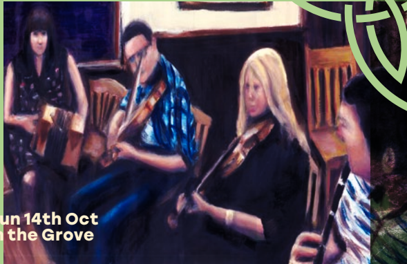
Sun 14th Oct In the Grove

Assembly Bar & Kitchen Headingley Enterprise and Arts Centre Bennett Road Leeds LS6 3HN