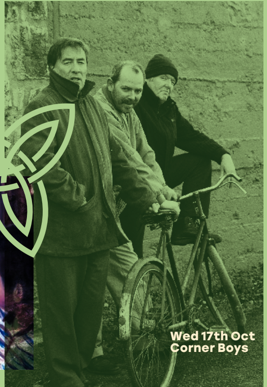
Wed 17th Oct Corner Boys

The time is 1963. The place is a small village in Ireland. For the two young women working in the local drapery shop, the visit