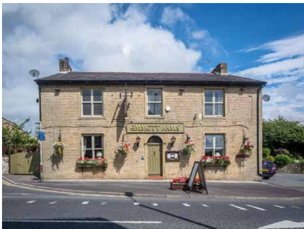
Front view of The Emmott Arms