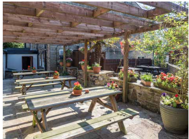
Beer patio area