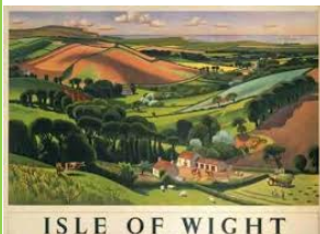
ISLE OF WIGHT

Please ensure full payment is received by Friday 14th February