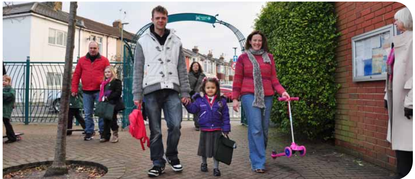
Gathering parents' views electronically can save time and save the environment.

If a school has any concerns, the headteacher/principal or the appropriate authority should contact enquiries@ofsted.gov.uk