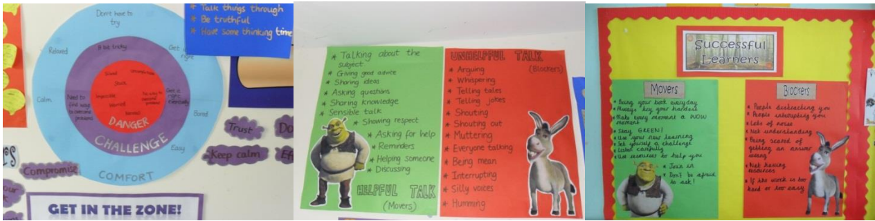
Challenge Zone- is the work right

All pupils should be able to list the feature of a Successful Learner and explain what they look like/sound like/feel like in action. It is our intention that the Successful Learners programme is embedded throughout our school.