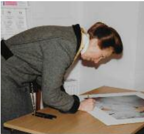
• A smiling Princess Royal leaves Reading Carers Centre. Below: Signing her photo

Last year we celebrated 20 years of delivering free information, advice and support to unpaid carers of all ages.