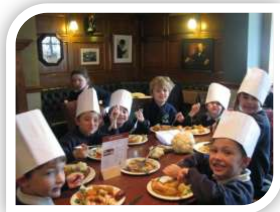
The children got to enjoy a carvery meal.