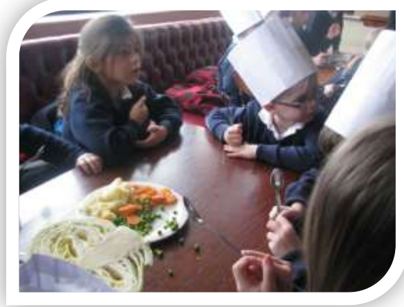
The children looked at raw vegetables, and then got to taste them once cooked.