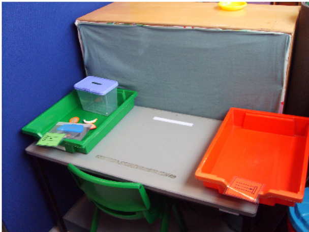
Left to right system

Or it can be a set of drawers with symbols on and a corresponding set of symbols on the desk to denote the order that tasks need to be completed. The pupil takes each symbol and matches it to the drawer before taking out and completing the task.