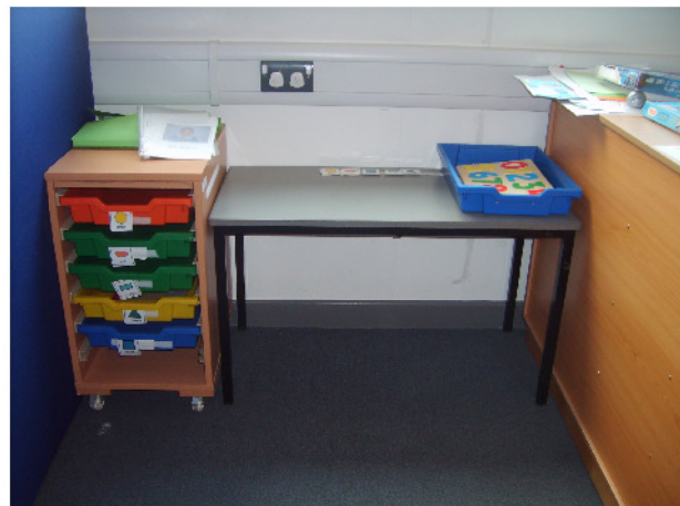
5 drawer system