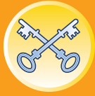
St. Peter's C. of E. Primary School Hindley