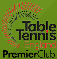
Table Tennis Coaching Academy