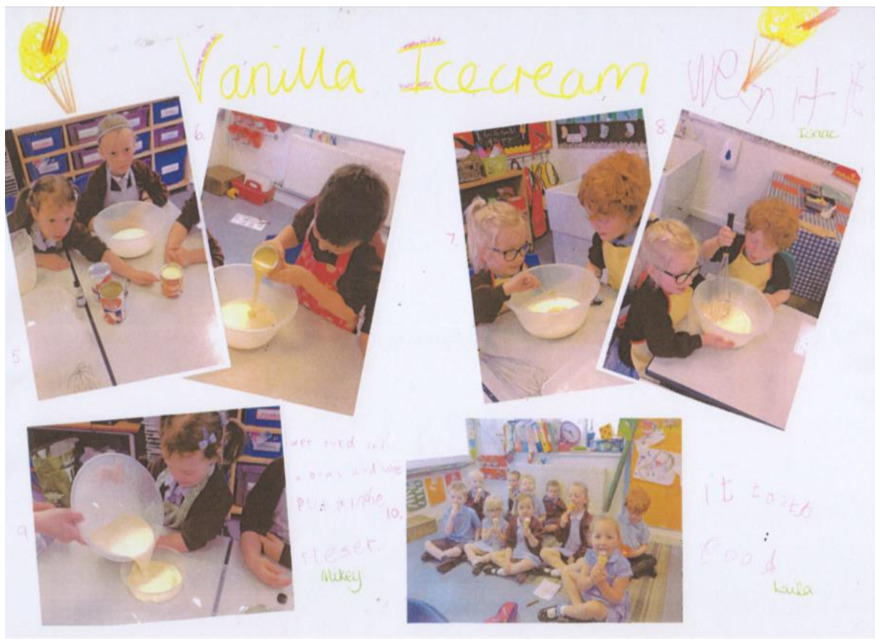
The following day they were able to sequence the photographs and write about making vanilla ice-cream. I am sure they will be making it again soon to share with their friends in school!