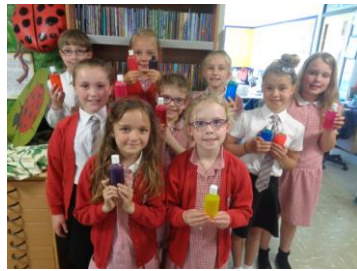
This week Aromatherapy Club made soothing bath oils

What a busy and action packed final week of half term with: two high quality parent express events; Year 3's visit to Magna; a choir workshop session for the Year 5 children working with Opera North; our half termly Parent Forum meeting; a 'Bible Explorer' R.E. session for Year 5 from our visiting specialists; the finals of our highly contested intra-school Multi Skills competition as well as our usual range of extra-curricular activities including Active Games, Aromatherapy, Archery, Sand Art, Yoga, Cheerleading, Science Magic etc. It is lovely to see our pupils so engaged by our vibrant curriculum delivery.