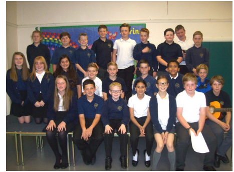
Stars of the week— Woodhouse