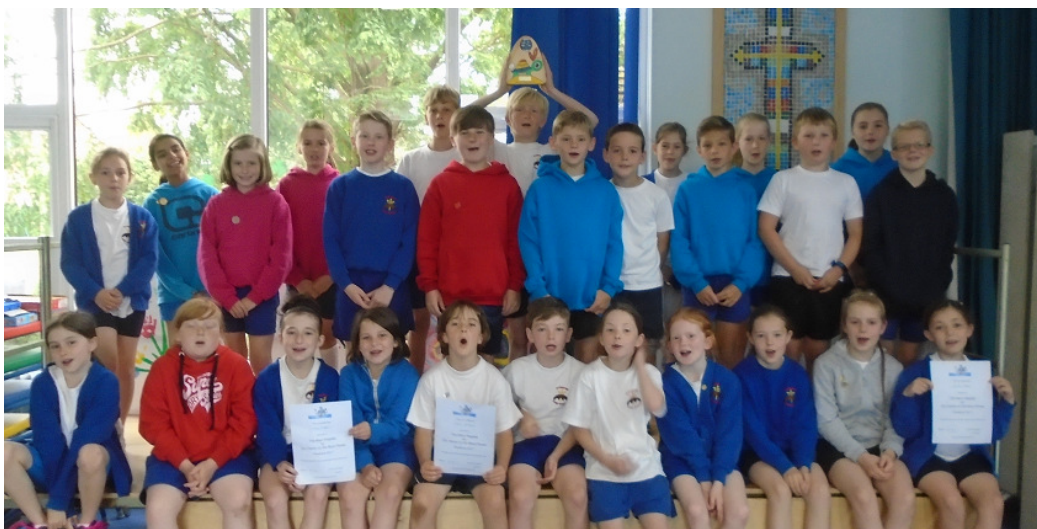
Bellboating Year 4 and 5