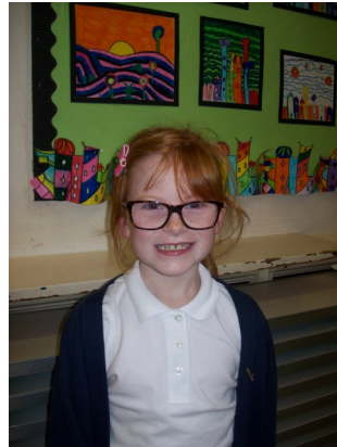
Support Staff Nomination Winner