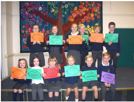
This Weeks Earth Award Winners

01422 354209 head/admin/clerical@copley.calderdale.sch.uk