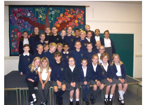
Lydbrook—This Weeks Stars